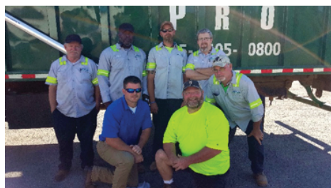
Childersburg, Alabama Staff.