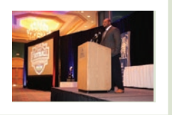
Deuce McAllister speaking at 2015 NAIA Champions of Character Luncheon

In August 2016, we announced that former running back for the New Orleans Saints and Ole Miss, Deuce McAllister, was named President of Waste Pro of Louisiana. Originally from Ludlow, Mississippi, Deuce has developed significant relationships in the Region, both through his sports career and his service to the community.