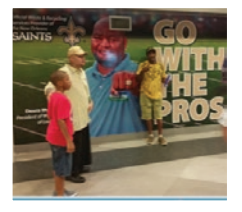
Fans take advantage of photo-op with Deuce McAllister inside the Mercedes-Benz Superdome.

Waste Pro is now providing solid waste collection as well as recycling services for all Saints home games and other special events held at New Orleans' Mercedes-Benz Superdome and at the Saints training facility in Metairie, Louisiana. As an official team sponsor, we are also permitted to use the Saints logo on our vehicles and in promotion and marketing campaigns.